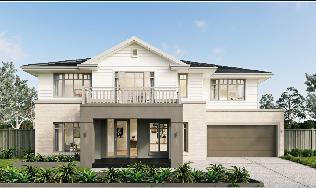
Price excludes: Fencing, Landscaping, Concrete pavers, Planter boxes, Decking